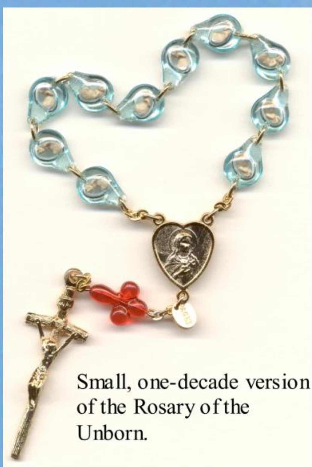
Small, one-decade version of the Rosary of the Unborn.