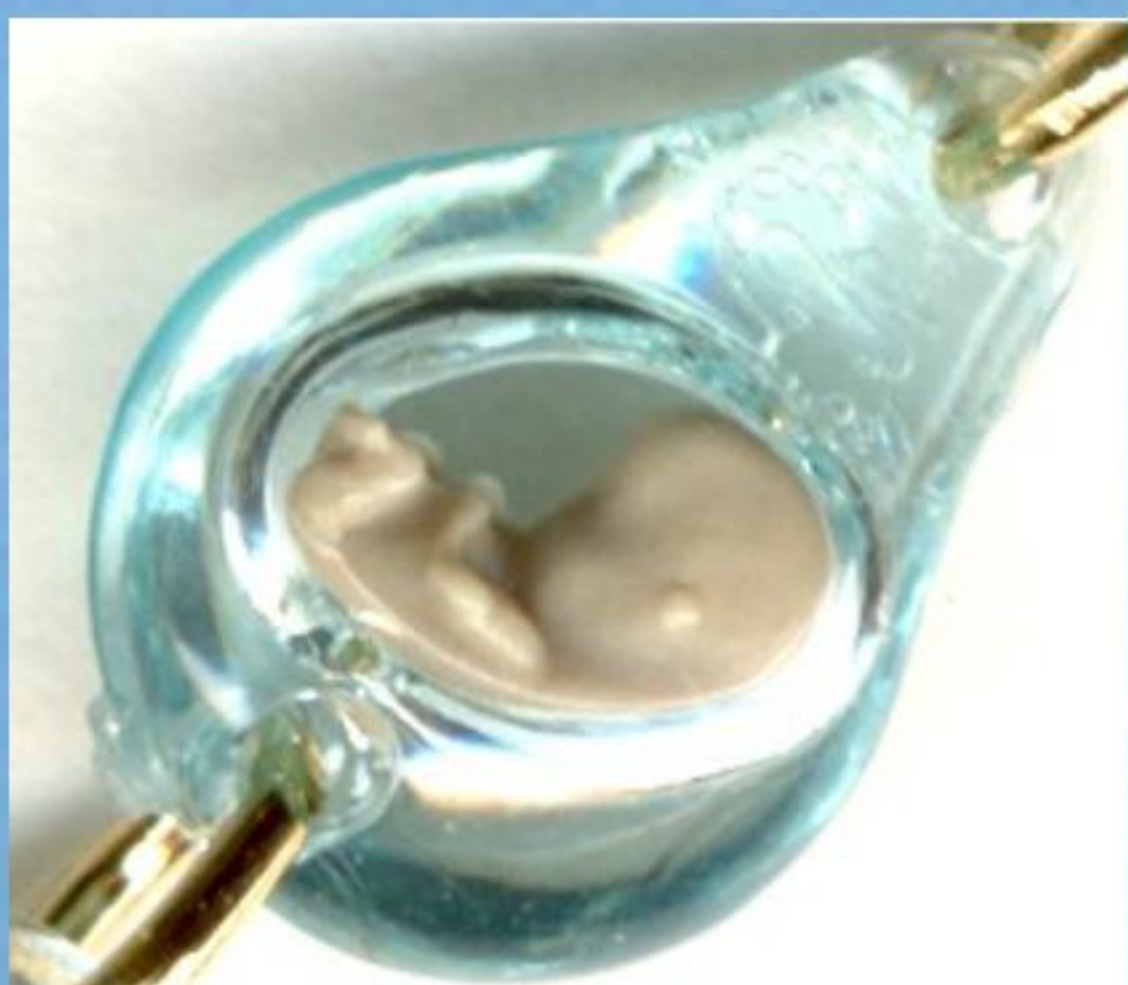
Each teardrop-shaped ‘Hail Mary’ bead holds inside a tiny image of an unborn baby.

Promises from Our Lord Jesus: “Please tell the world that each “Our Father” recited on the Rosary of the Unborn assuages My grieving Heart. Further, it withholds the Arm of Justice.” “Every rosary prayed from the heart to its completion on these beads mitigates the punishment as yet withstanding for the sin of abortion”.